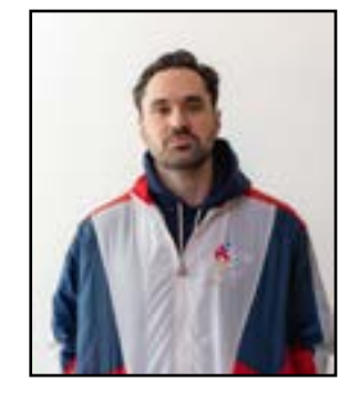
Things Podcast TID