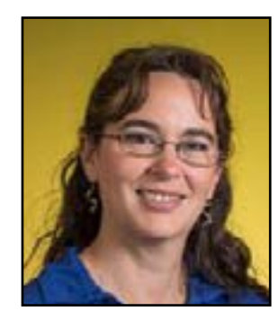
New Orleans Discussion