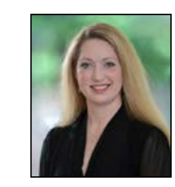
College of Medicine Discussion